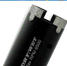
Diamond construction drill bit

Boreway Machinery Co., Ltd. www.diamondtools.top www.boreway.com