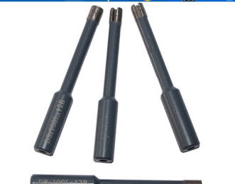
High strength diamond PC drill bit

Boreway Machinery Co., Ltd. www.diamondtools.top www.boreway.com