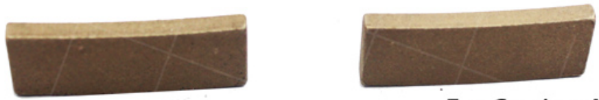
For Cutting Andesite