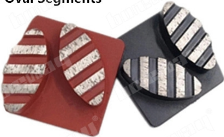
Husqvarna Redi Lock or Scanmaskin Redi Lock