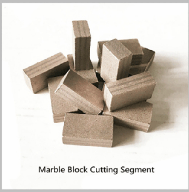
Marble Block Cutting Segment