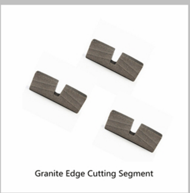
Granite Edge Cutting Segment