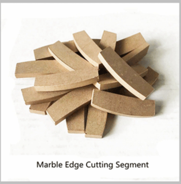
Marble Edge Cutting Segment