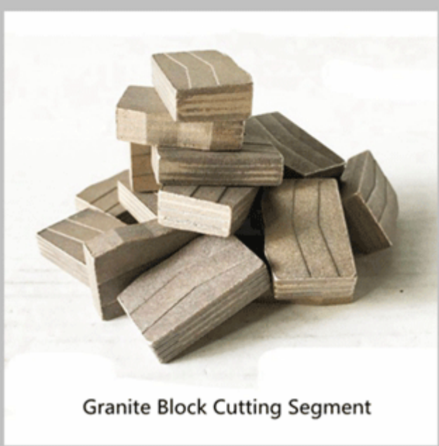
Granite Block Cutting Segment