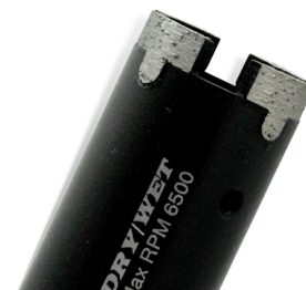
Diamond construction drill bit

Boreway Machinery Co., Ltd. www.diamondtools.top www.boreway.com