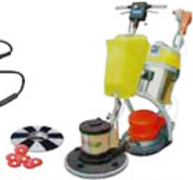
Floor polishing machine