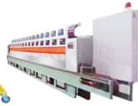
Ceramics polishing machine