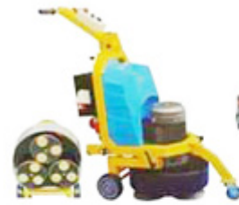
Large floor polishing machine