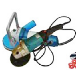
hand polishing machine