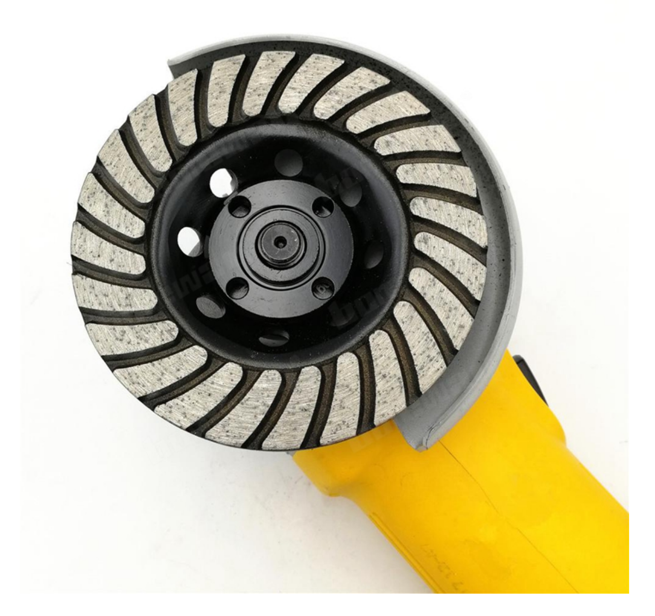
If you are interested in our products, you can click on me.