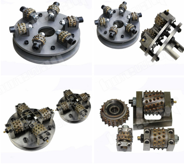
Concrete and Stone Frankfurt Bush