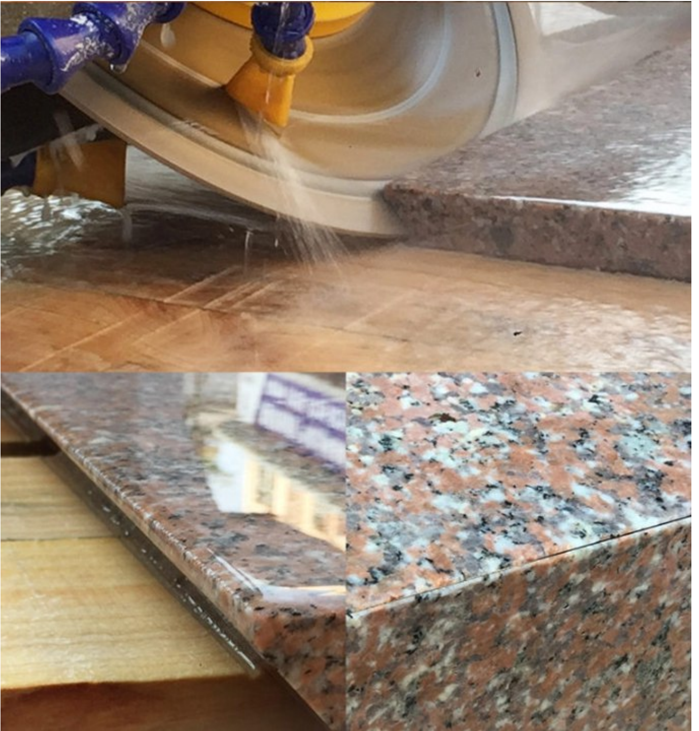
Diamond Segment Cutting Supplier China , Products Cutting Effect: