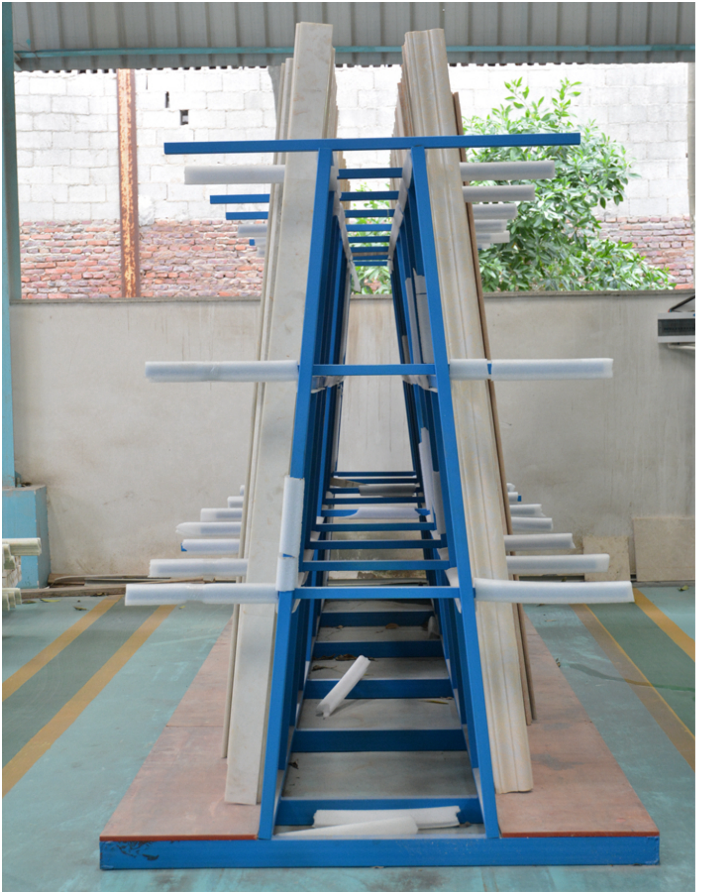
Packing & delivery