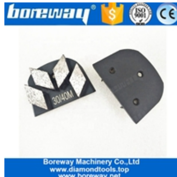
Four Segments Grinding Shoes