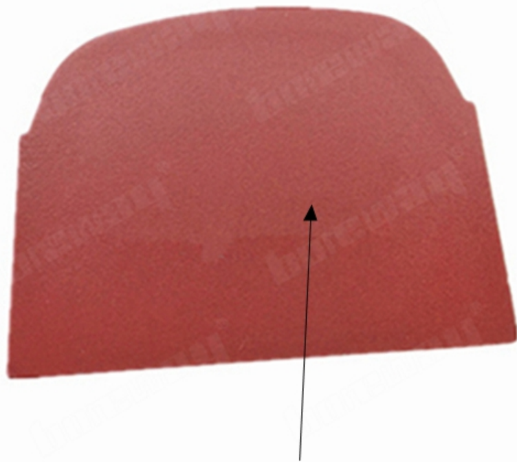
Lavina Quick Lock Blank