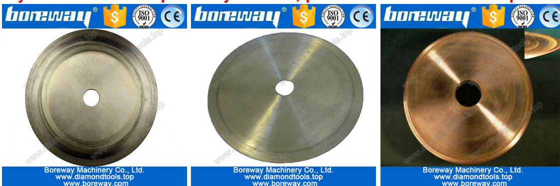
Electroplate jade cutting blade

If you do not see the product you want , please contact us for more product images .