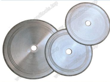
Straight teeth jade cutting blade

Boreway Machinery Co., Ltd. www.diamondtools.top www.boreway.com