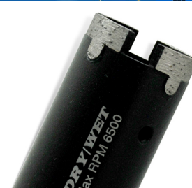
Diamond construction drill bit

Boreway Machinery Co., Ltd. www.diamondtools.top www.boreway.com